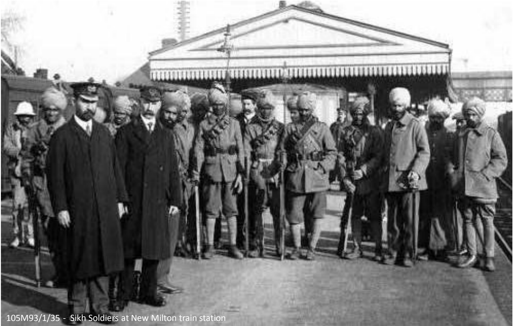
105M93/1/35 - Sikh Soldiers at New Milton train station